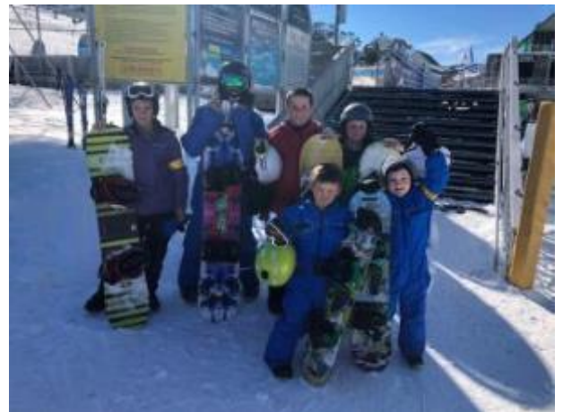
The snowboarding boys above and below, taking a break!!