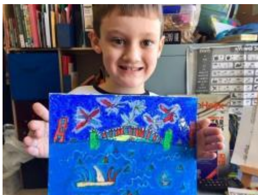
Sydney Harbour Bridge