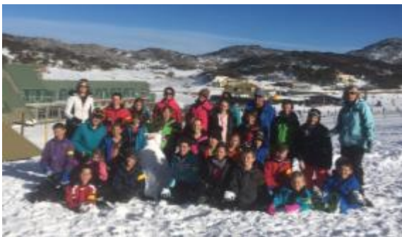
BWSODE 'Ski Team'