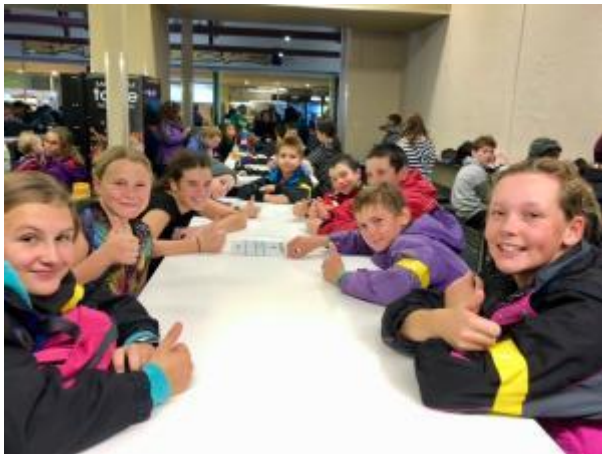
Back at the 'Station'