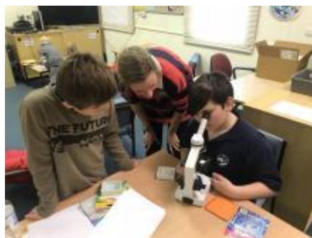
Budding future scientists hard at work