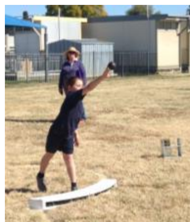
Above and below, students in action in the field events at the Bourke Athletics Carnival