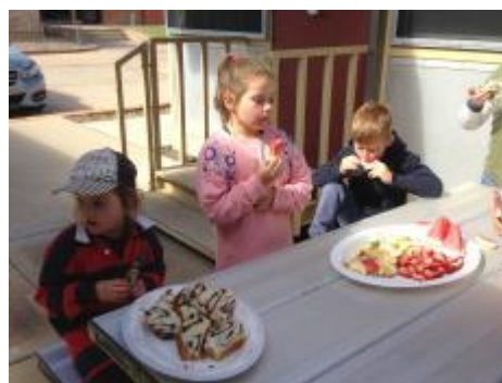
Students enjoying the French lunch