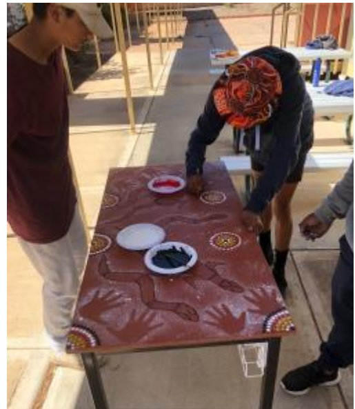
Beautiful art work created by the boys from Bourke High School

Students from Bourke High School visited the Bourke Centre on Friday morning to conduct an Aboriginal Art workshop with our students. It was a fantastic opportunity to learn something new. The students spent the day working with the boys and created some amazing art work which was a highlight of the day. The boys were a credit to their school and should be very proud of the way that they conducted themselves on the day. The students also worked through learning centres focusing on threading, sketching, the lifecycle of a butterfly, and using microscopes.