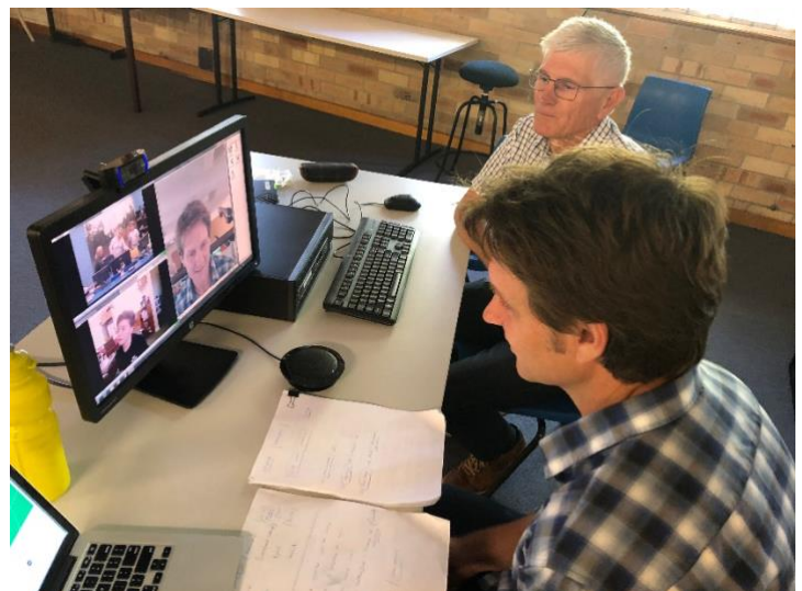
Craig's view of the students