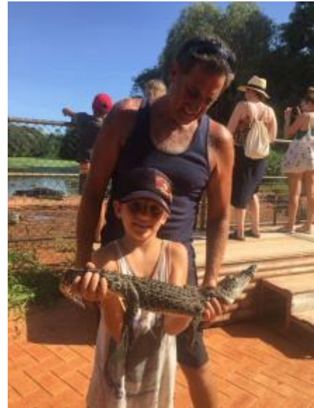
Brave Oscar also with a crocodile