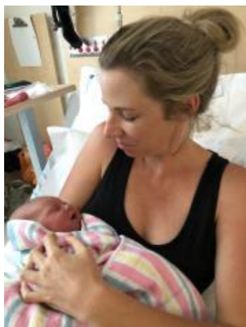
WELCOME TO LILLIAN