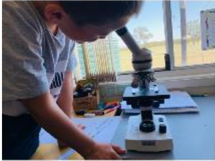
7 Science on the go