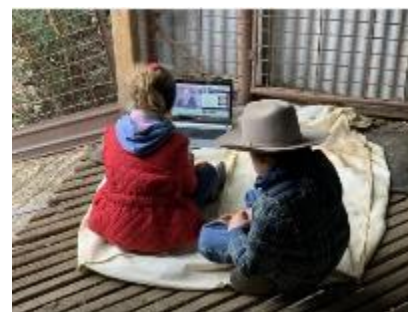
3 Lessons in the Shearing Shed – while shearing takes place