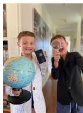
4 Discovering our world