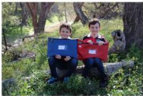
8 Work Packs are here