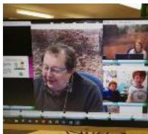
2 Assembly over Satellite Teacher in Bourke, students in Hungerford

These photos will be showcased on the Student Voices website for other schools and communities to see. Additionally, some of the winning work may also be used on the Rural and Distance Education website and in future publications to promote rural and remote education.