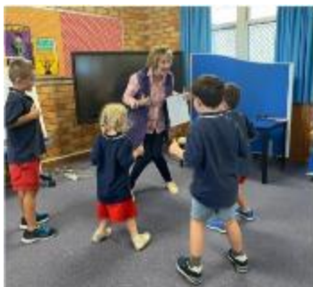
9 Integration Day – Time to catch up with schoolmates and teachers