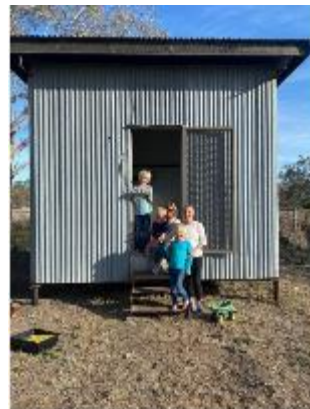
1 Our School Room

10 th & 11 th Dec – Walgett Integration and Presentation Days