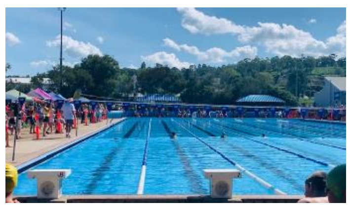
The beautiful Armidale pool on a picture perfect day