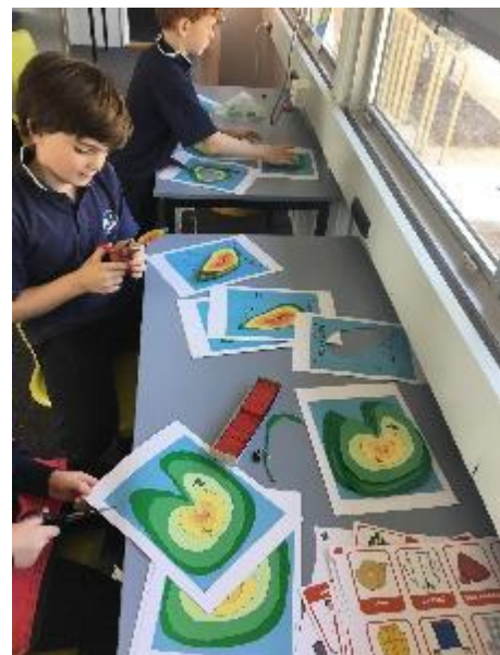
Above and below the Integration Day action at the Bourke Centre