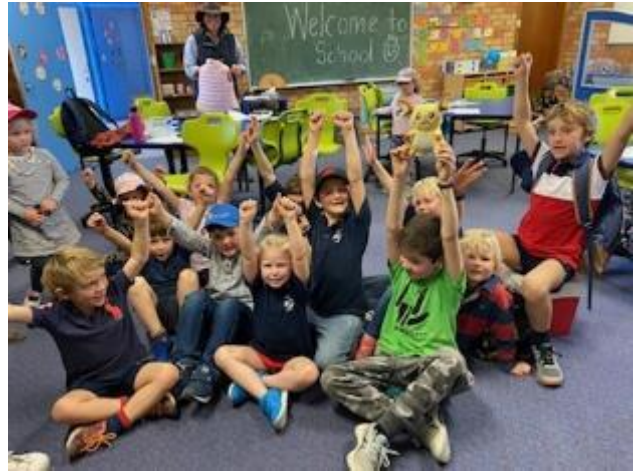
Above and below Walgett students at Integration Day

Late in Term 2 saw the reintroduction of Integration Days to both Centres. This was warmly welcomed by staff, students and their families and it was marvelous to have the rooms of the Centres filled with chatter and activity.