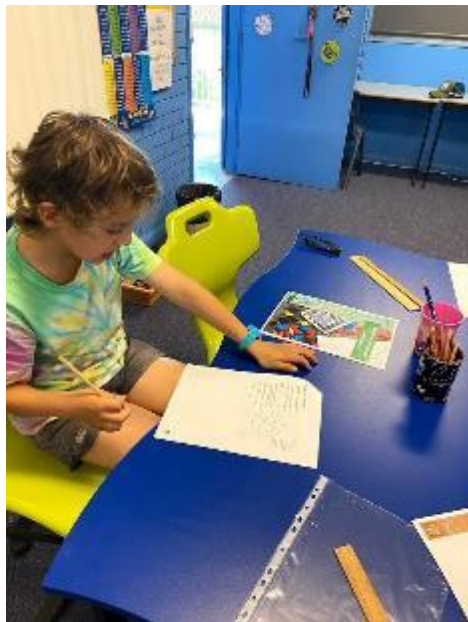
Students hard at work on Integration Day