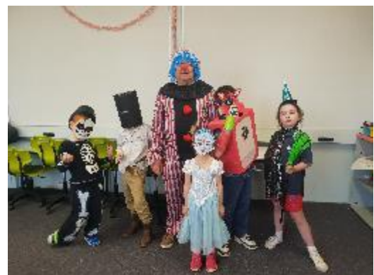
Everyone getting right in to the spirit of the day

Halloween was the theme of the day at the Bourke Centre Integration Day in week 4.