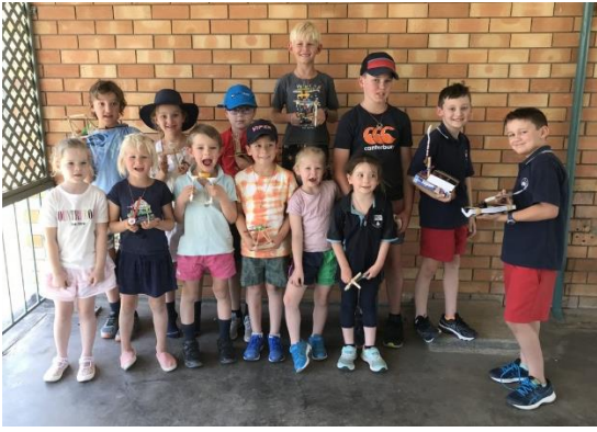
A fiercely contested catapult competition!!