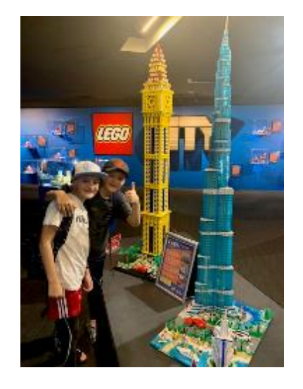
Working hard with their school work but also enjoying many of the sights and activities of Sydney while they spend time with their father on the film set.