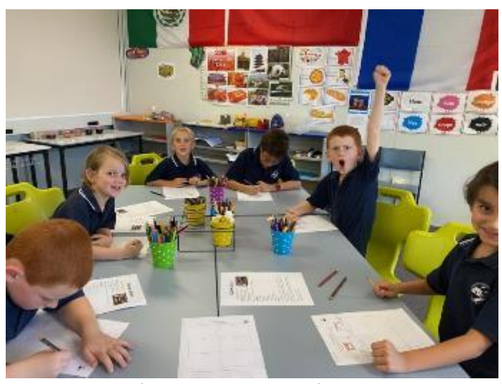
Plus plenty of play, art and craft along with

Science experiments looking at the effects of different substances on egg shells, where composition is very similar to our teeth were carried out with great interest.