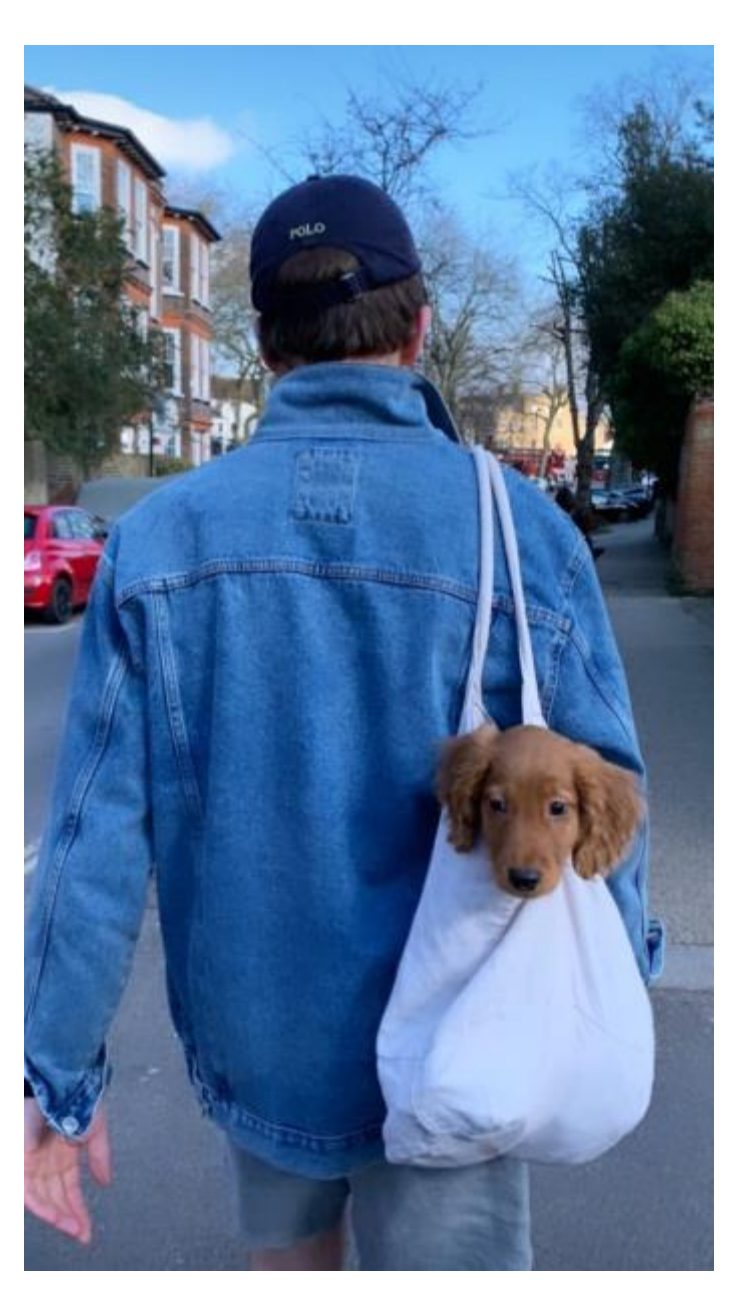
Farewell until Term 2