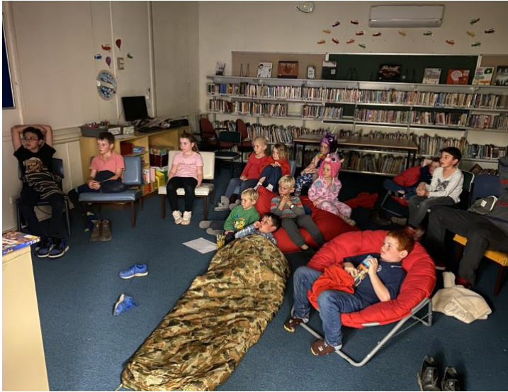
A movie night in the Walgett Centre Library was greatly enjoyed by all the students

Special thanks to the John Murray Art Gallery in Lightning Ridge who very kindly donated four prints to BWSODE to hang in their Center's. The students all signed a thank you card on the last day of Mini School, in appreciation of this generosity.