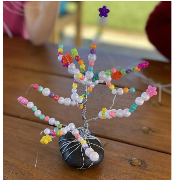
An example of the beautiful craft made at Mini School