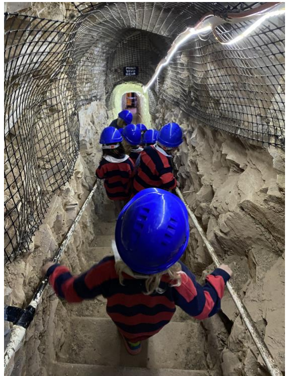
Down they go into the mine...!!!