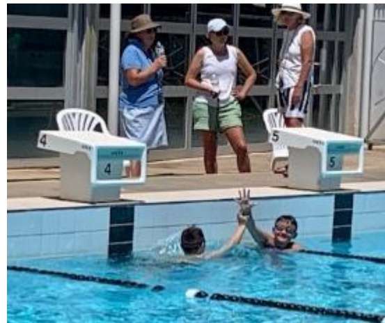
Some nice sportsmanship in the pool