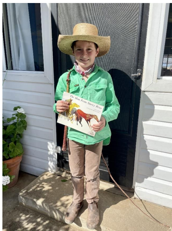
Archer – The Man for Snowy River!!