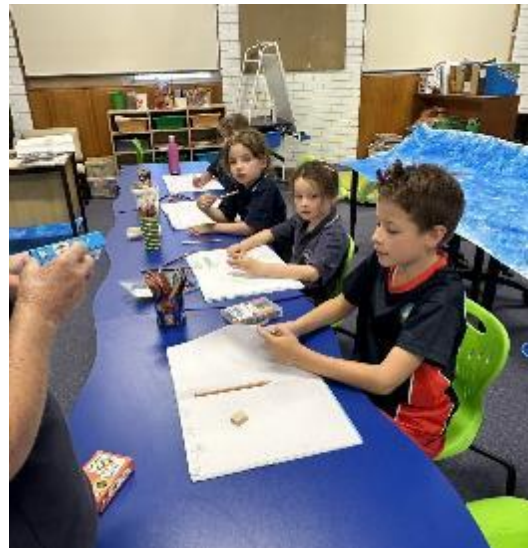
Hard at work in the 'new look' classroom