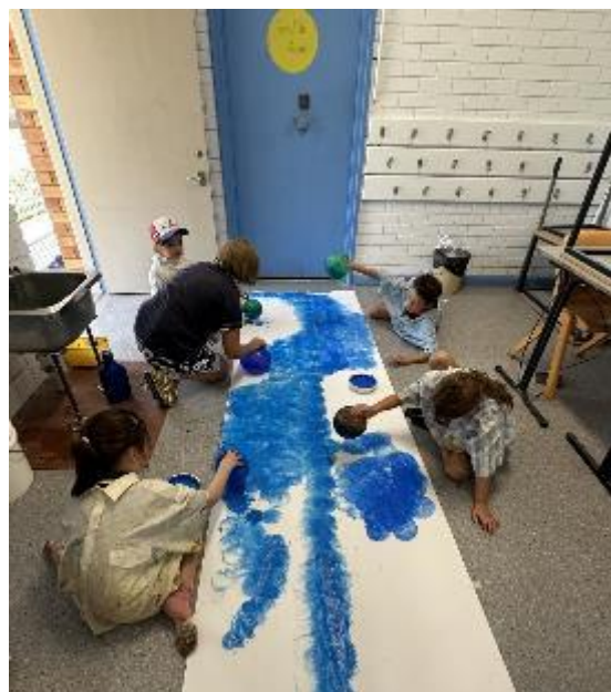
Walgett Show preparation in progress